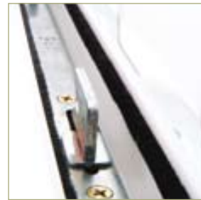
Featuring the latest high security locking systems