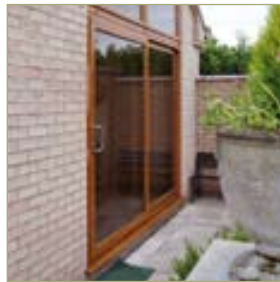
Patio doors are perfect for leading into your garden space

Available in a range of colours such as classic cream or traditional timber appearance, you can select a different interior colour to blend with your interior décor.