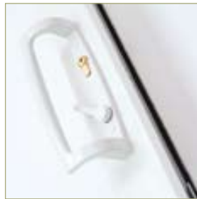
Available in a range of stylish handle options