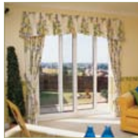
Patio doors increase natural light into your room