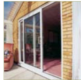
Ideal for rooms leading into a conservatory